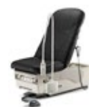
Ritter 253 LED Medical Exam Light