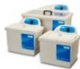
Midmark Soniclean® Ultrasonic Cleaners